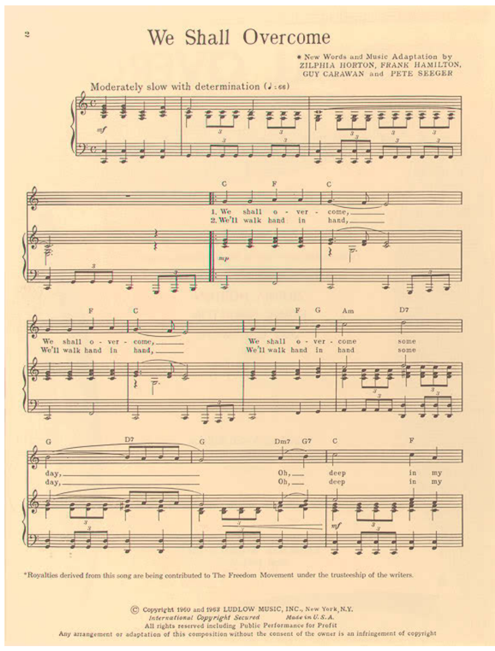
African American Odyssey. (n.d.). Retrieved June 15, 2016, from <a href="http://lcweb2.loc.gov/ammem/aaohtml/exhibit/091900.">http://lcweb2.loc.gov/ammem/aaohtml/exhibit/091900.</a>