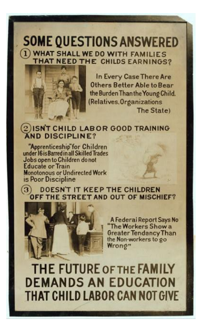
Image Title: Exhib[it] Panel Persistent URL: <u>http://www.loc.gov/pictures/resource/nclc.04988/</u>

Title: Cartoon Persistent URL: http://www.loc.gov/pictures/resource/nclc.04956/