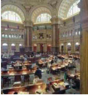
Reading Room of the Library of Congress's Thomas Jefferson Building