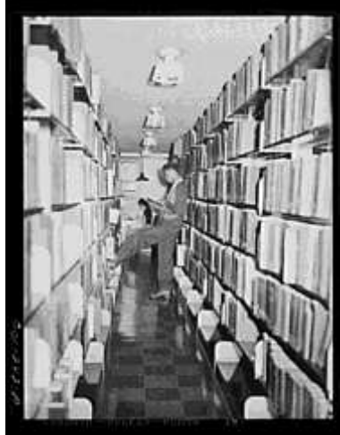
Student in Library Stacks, Atlanta University, 1942