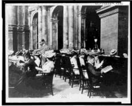
Students in the Reading Room of the Library of Congress, 1899