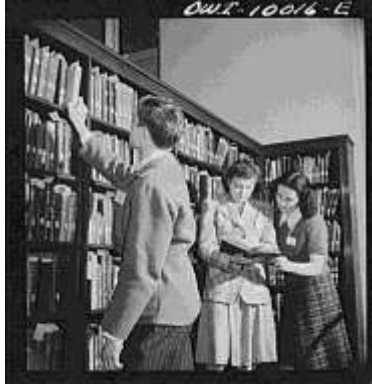
High School Students Examine Books in the Library of Congress, 1942