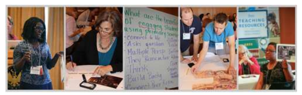
Library of Congress Teacher Institutes and Seminars