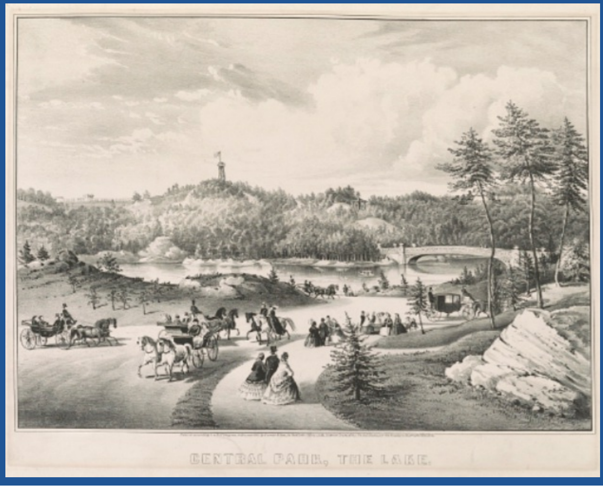
[New York] : Published by Currier & Ives, c1862.