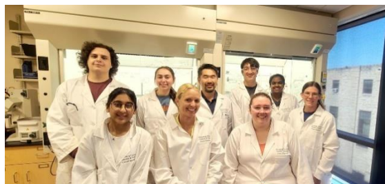
2022 Summer Research Team at WU

You must be currently enrolled as a junior in your high school to apply. You also must be able to work full time from June 22 – July 21 on campus (there may be some flexibility with the dates). An important part of the job of a scientist is to communicate the findings to others. The NSF research assistant is expected to give a presentation of his/her research experience to the peers at his/her high school and therefore must have the support of his/her high school. After the presentation, please share with us how it went!